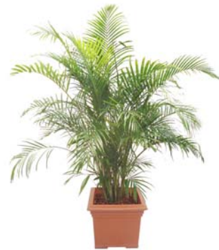
Golden Cane palm