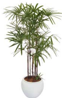
Raphis palm - 3-4 stem