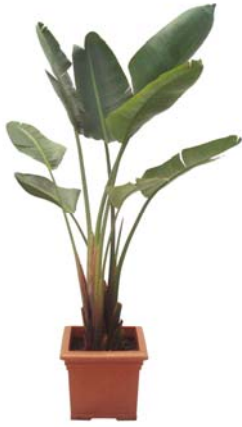
Strelitzia Nicholi (Banana leaf Palm)