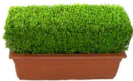
Box hedge - small