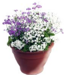
Annual Colour Bell