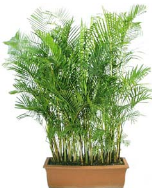
Golden Cane hedge