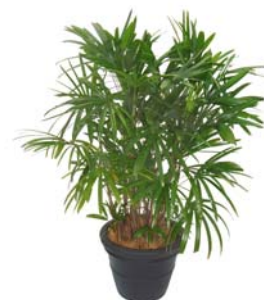
Raphis palm - small