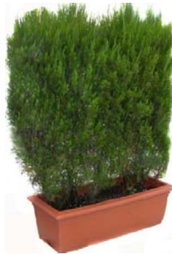
Spartan conifer hedge