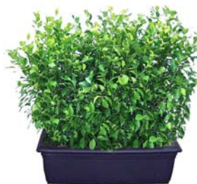
Emerald Ficus hedge