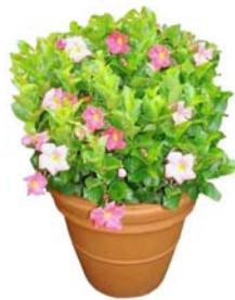
Brazil Jasmine shrub