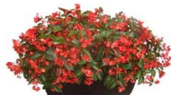
Annual colour hedge