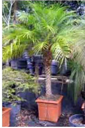
Dwarf Date palm - med