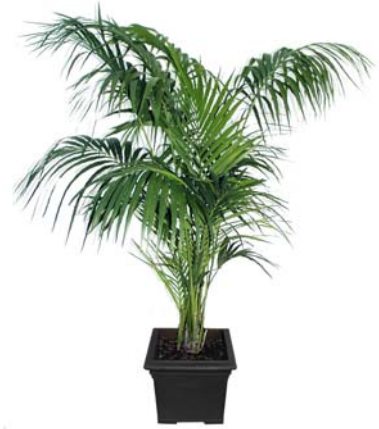
Kentia palm – tall