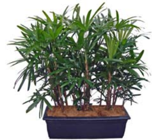
Raphis palm hedge